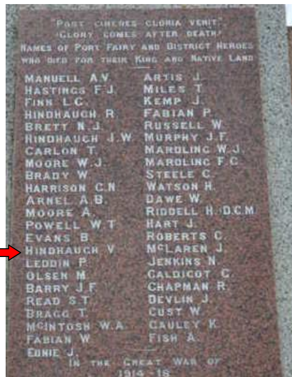
Port Fairy War Memorial